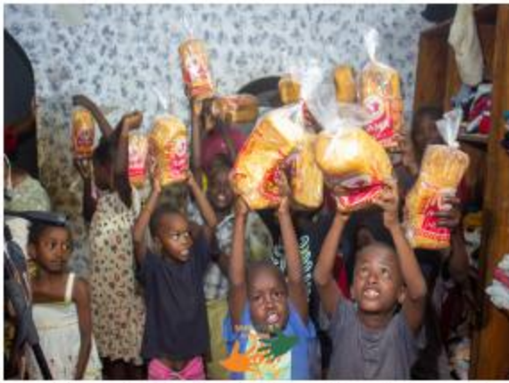
Children at the distribution table with solar lamp boxes — December 2025