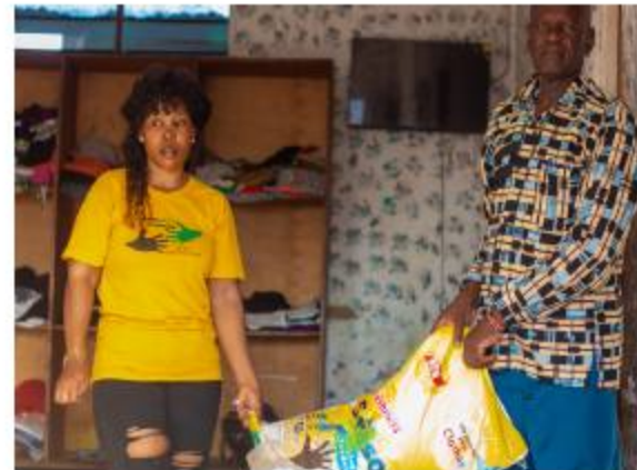
Barn Och Kvinnor volunteer and facility director with laundry detergent — household hygiene essentials, 2025