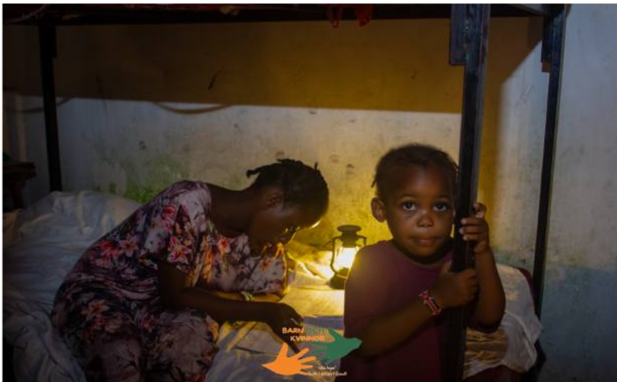
A caregiver and young child lit by the solar lamp at night — reflecting the household-level safety and wellbeing impact of the energy access intervention