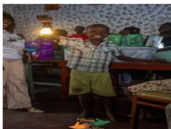
A boy joyfully holds his solar lamp aloft at the distribution ceremony — December 2025