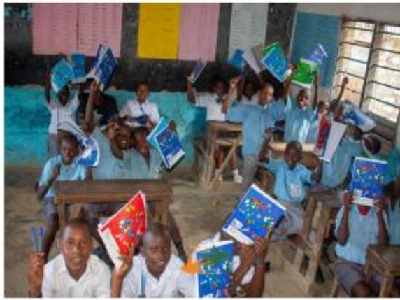
Children in classroom uniform raise colourful notebooks during in-class materials distribution — 2025 termly programme