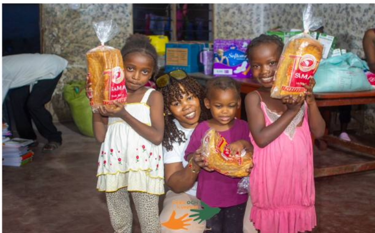
Softcare sanitary pads and Kudwa Long Life Milk among supplies at the December 2025 distribution — combining nutritional and hygiene support in a single coordinated delivery