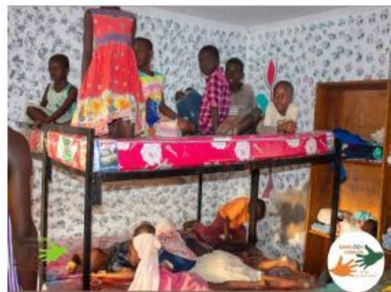
Children in their dormitory on the newly installed POA mattresses — a safe sleeping environment for the first time