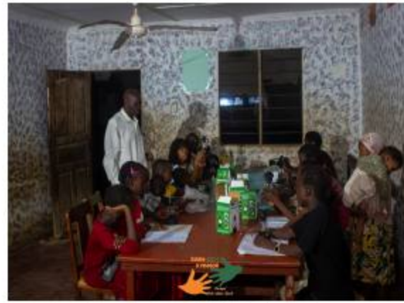
A child studies by solar lamplight in her dormitory, replacing dangerous candles