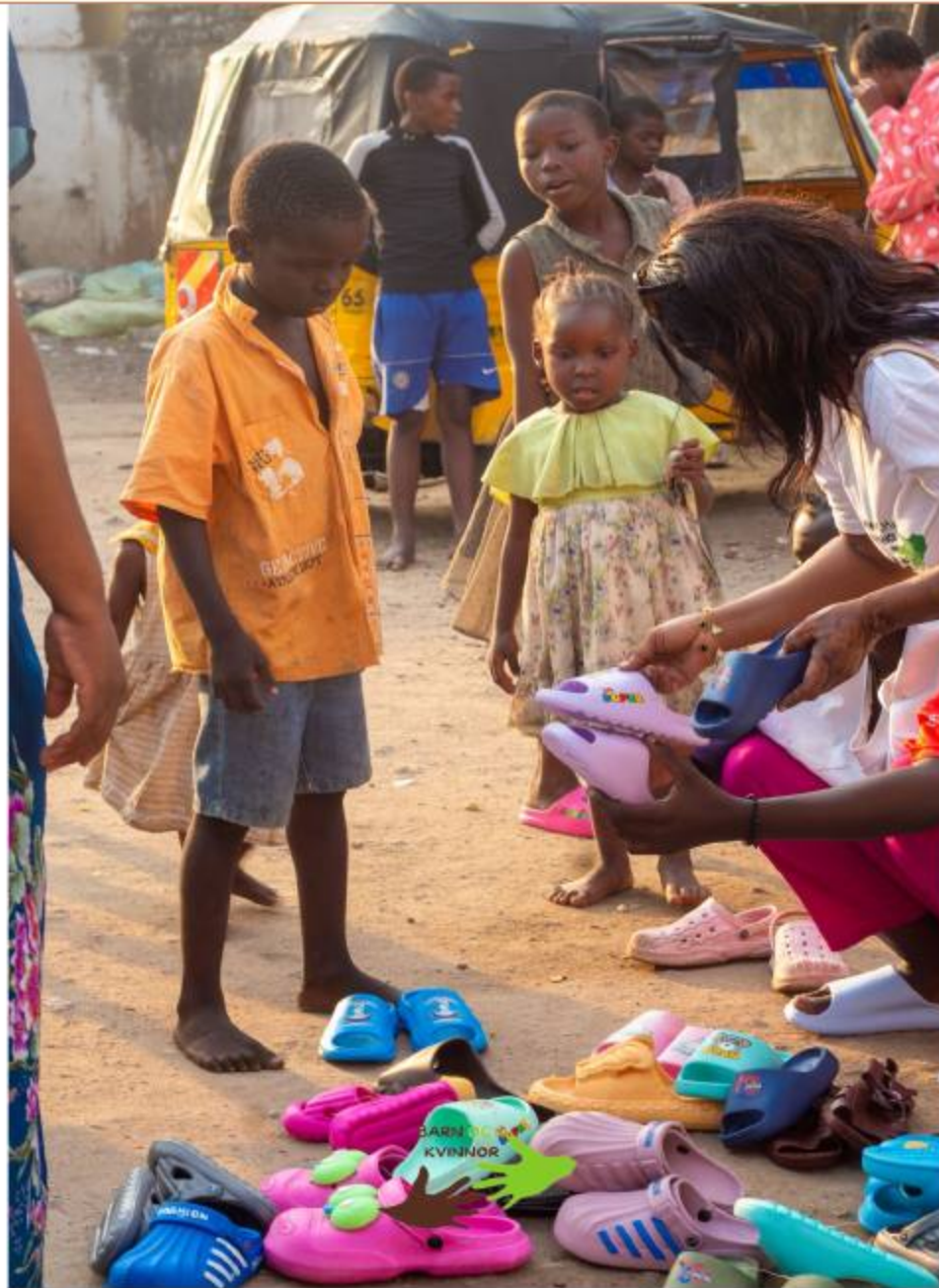
A Barn Och Kvinnor Organisation volunteer kneels to fit sandals on a barefoot child — an individual, dignified shoe fitting conducted for each child during the 2025 footwear donation