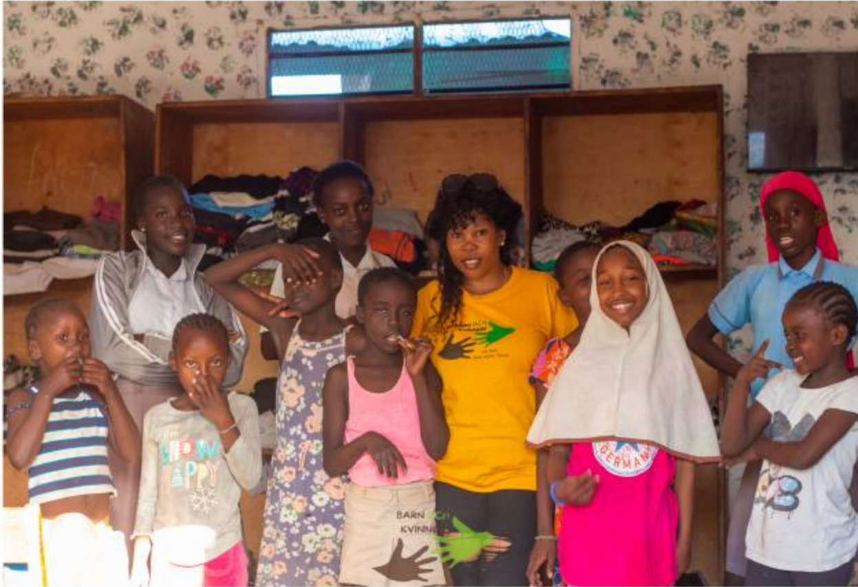
Barn Och Kvinnor Organisation volunteer with children at Likoni AIDS Orphanage Center — 2025 Annual Visit