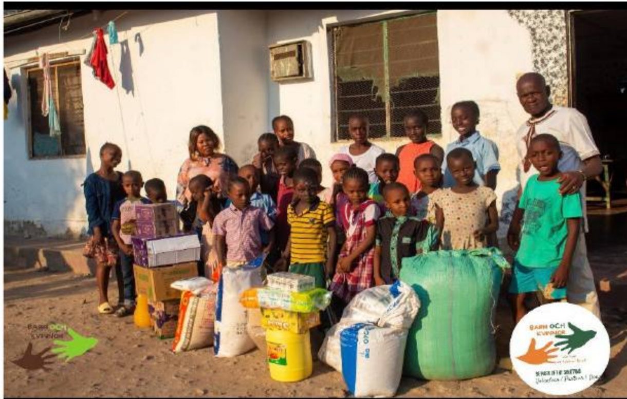
Barn Och Kvinnor Organisation volunteer and facility director with children gathered around a full food donation — rice, cooking oil, flour, and household supplies delivered to Likoni AIDS Orphanage Center

Barn Och Kvinnor Organisation volunteer alongside bulk food supplies including KissKids Super Dry Baby Diapers, large rice sacks, cooking oil, and household staples — delivered to Likoni AIDS Orphanage Center as part of the monthly nutrition programme