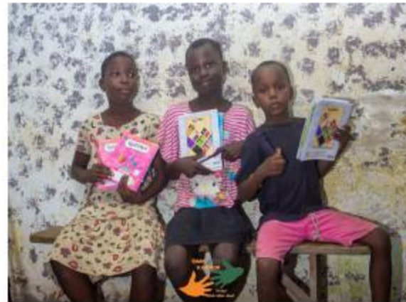
Three children at the orphanage display their KAZOKU exercise books from the termly distribution