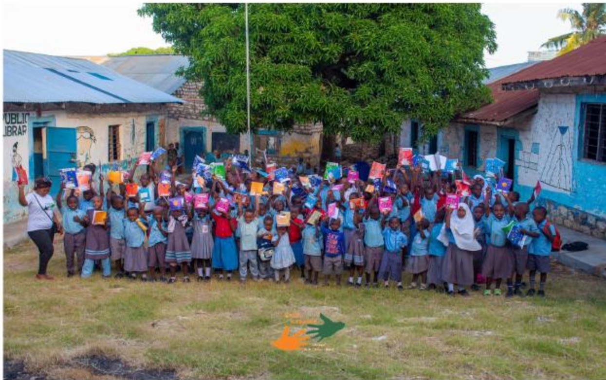
The entire school population raises their newly received exercise books and notebooks outside the school grounds — a whole-school distribution day, 2025