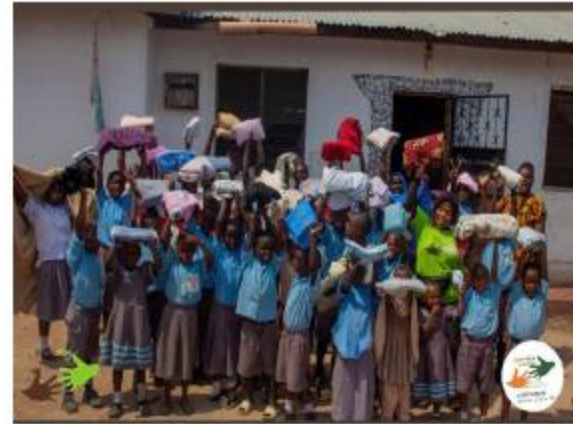
Children and volunteers raise bedsheets and blankets in celebration — 2024 dormitory welfare intervention