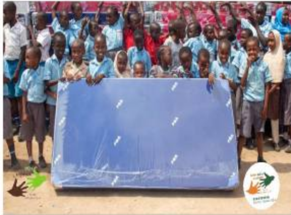
Children in school uniform celebrate around a new POA mattress during the 2024 donation handover ceremony