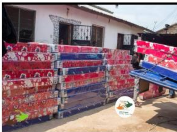
POA mattresses arriving at the Likoni facility — 40 mattresses stacked and ready for installation, 2024