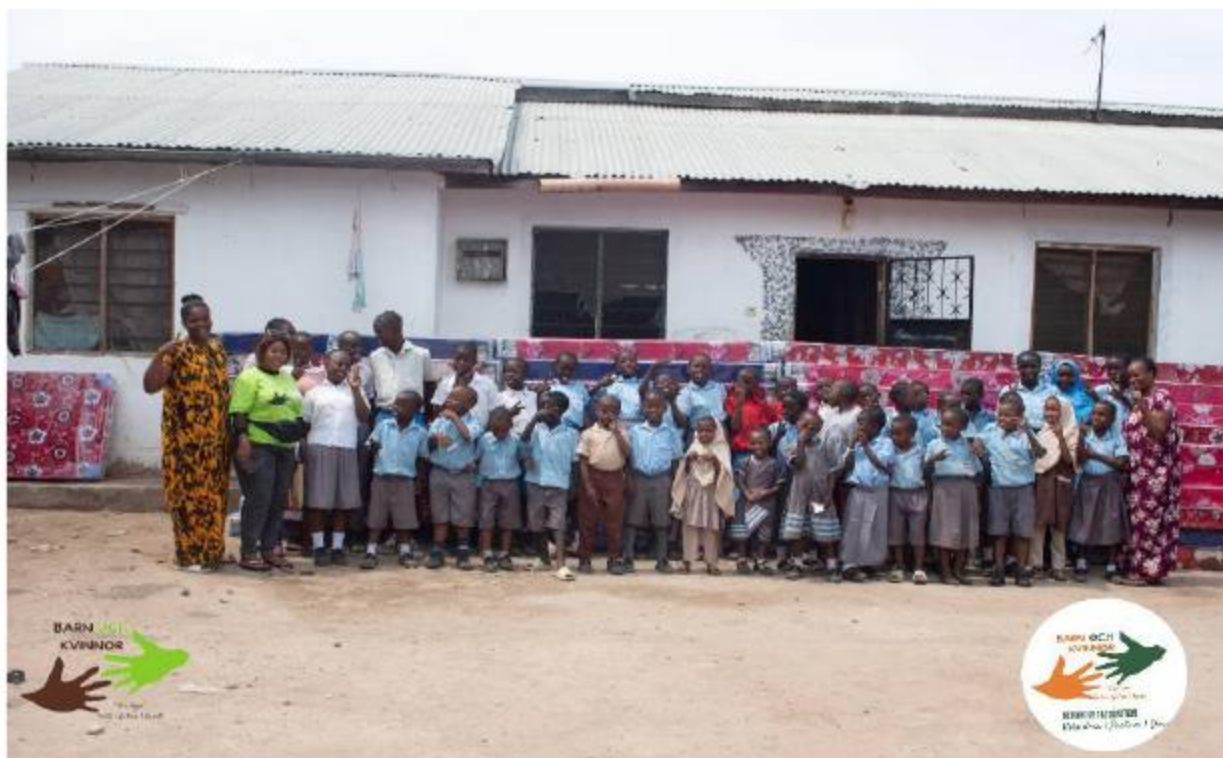
Barn Och Kvinnor Organisation volunteers, facility staff, and all children gathered in front of the Likoni facility with donated POA mattresses visible behind — 2024 Beds & Mattress Programme