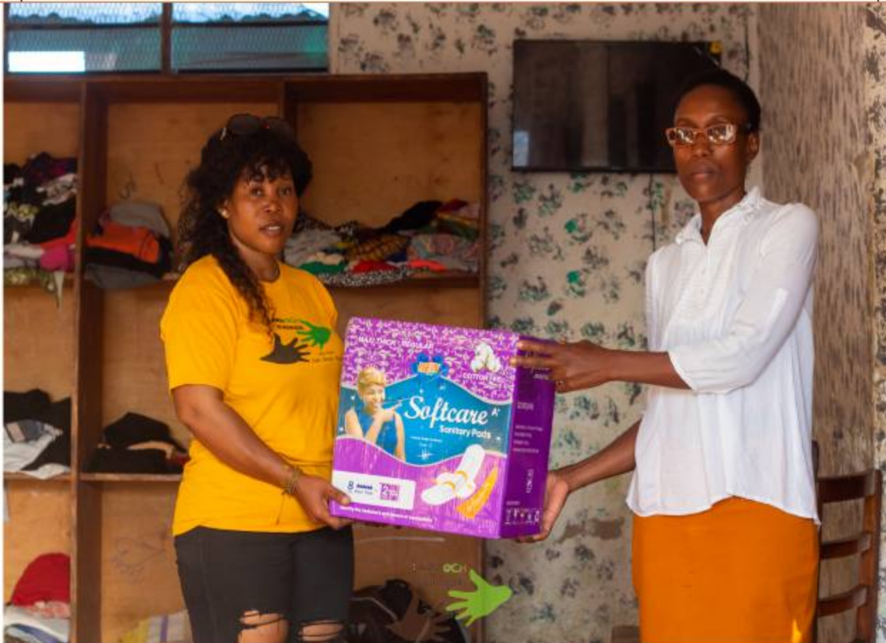
Barn Och Kvinnor Organisation volunteer formally presents a bulk supply of Softcare Sanitary Pads to the Likoni facility director — ensuring sustained MHM supply between programme visits, 2025