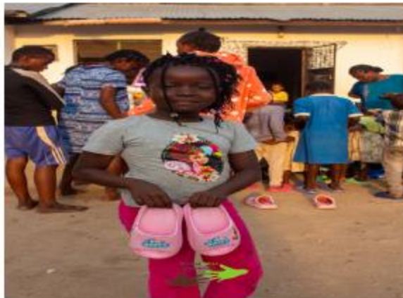
A girl proudly holds her new pink "Happy" sandals — her first pair of shoes, received during the 2025 footwear distribution at Likoni