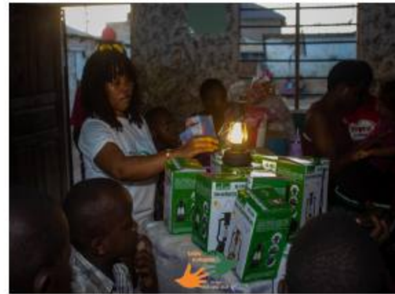
Children joyfully raise loaves of SAMA Fresh Bread — celebrating a monthly nutrition delivery