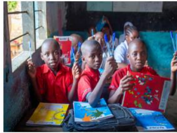
Boys in red school uniform hold up brand new NATARAJ pens received alongside their exercise books — 2025