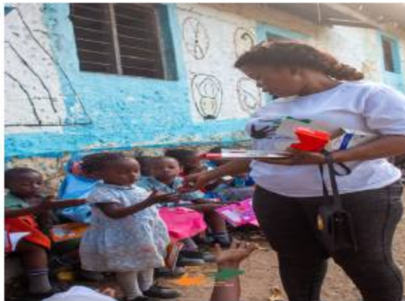
Barn Och Kvinnor Organisation volunteer hands stationery directly to a young child outside the school block