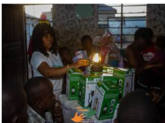
Volunteer demonstrates the JS-T93 solar lamp to children and caregivers at the December 2025 distribution