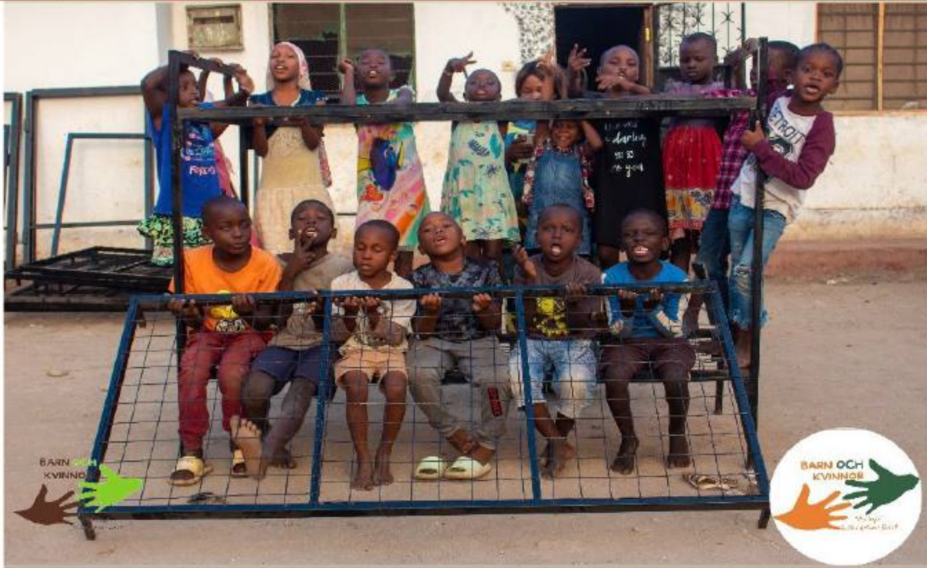
Children at Likoni AIDS Orphanage Center — 2024 Bed & Mattress Donation Programme