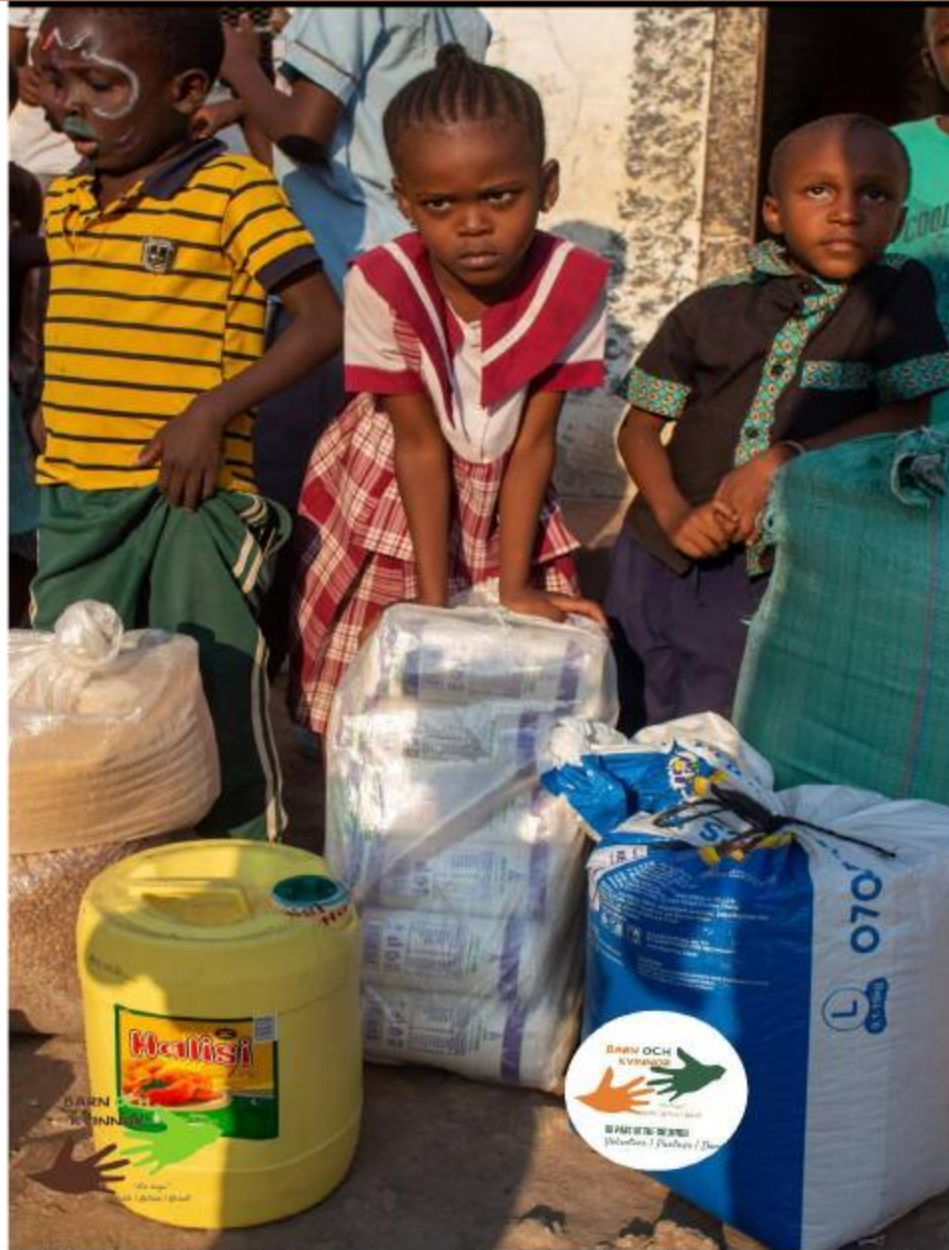
Children at Likoni alongside Halisi cooking oil, rice sacks, and bulk food packages — the nutritional supplies that supplement their daily meals through the monthly food provision programme