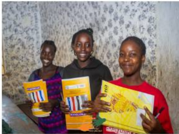
Volunteer distributes food packages to children during a monthly food delivery