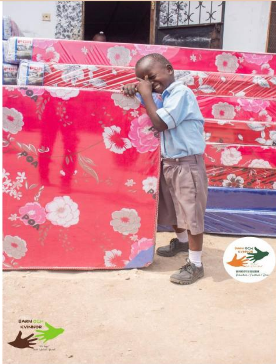
A child's pure joy — a boy leans against a brand new POA mattress at the Likoni facility, overwhelmed with happiness. For many of these children, this was the first mattress they had ever seen with their name on it — 2024